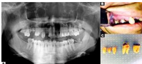
Figure 2: A) Panoramic radiograph showing bone integrity in structures of the middle third and mandible. B) Intraoral aspect. C) Dental elements extracted by association with carious lesions.