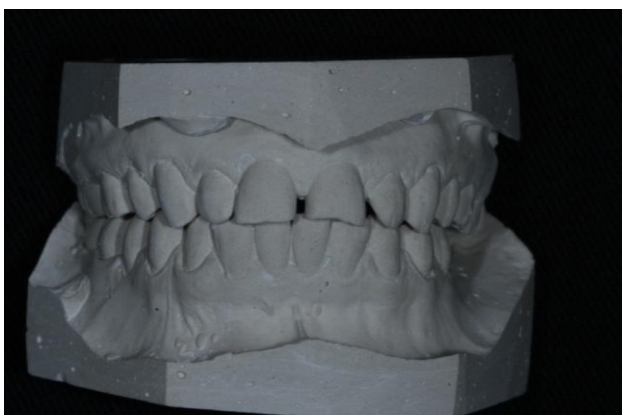
Figure 3. Model of study for making the diagnosis waxing and mock-up.

Finish this step with informed consent for the patient, it was decided by periodontal surgical treatment for smile correction and then the healing period, the completion of diastema closures with direct facets in composite, taking into consideration the effectiveness, treatment time, possibility of reversal and costs.