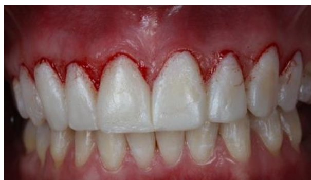
Figure 5. Mock-up used as a surgical guide and incision internal bevel.

With the scalpel blade 15c rounded up the mock-up of the first premolar right to left first premolar, with the blade facing apically forming an internal bevel (Figure 5).