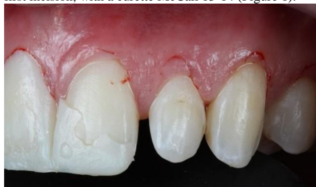
Figure 6. Mock-up removal and collar display to be removed.

Then, he removed the bis-Acrl resin, and the collar was removed following the contour performed by the first incision, with a curette McCall 13-14 (Figure 6).