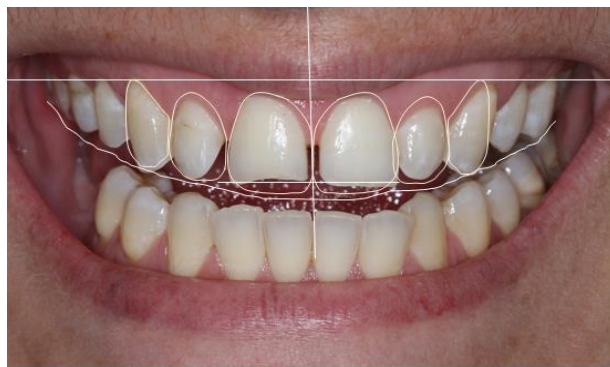
Figure 2. Digital planning with input lines to determine the new design smile.

After performing the oral hygiene instruction and final restorations on teeth compromised by decay, were performed intra and extraoral photographs for aesthetic planning smile. a molding was conducted in alginate (Hydrogun-Zhermack®, Badia Polesine (Rovigo) - Italy), with the aid of metal trays size S3 and I3, for making the study models. The photographs were entered in Key-note® program which was performed smile digital planning called DSD (Digital Smile Design). This procedure involves inserting paths, seeking symmetry and a new smile format (Figure 2).