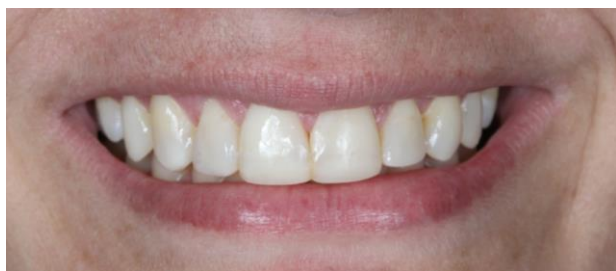
Figure 14. Final smiling.