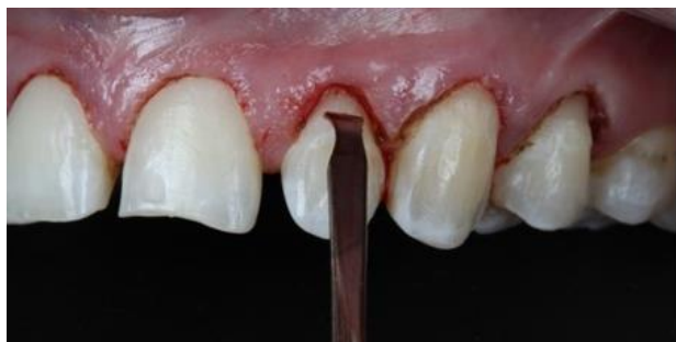
Figure 8. Restoring the biological space with micro via chisels gingival sulcus.

For better comfort during and after the procedure, we opted for the non-lifting of the flap technique, known as "flapless". The osteotomy was performed with a micro chisel straight Ochsenbein in. 1 (Figure 8).