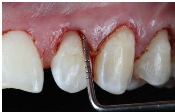
Figure 9. New survey for confirmation of 3mm of biological space.

Subsequently a bone in-va survey was conducted in finding a distance of 3mm-VA between the gingival margin and bone crest (Figure 9).