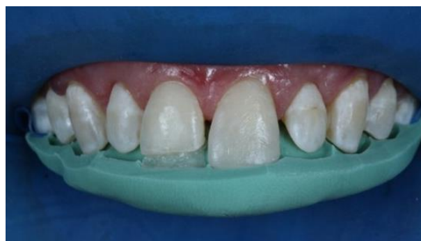
Figure 11. absolute isolation of the canoe type; palatal guide in position assisting in the reconstruction of teeth.

The palatine guide was positioned to facilitate insertion of the first layers of composite A2E (Filtek Z350 XT 3M / ESPE®, St. Paul, Minnesota, USA), responsible for form the palatal face of the teeth to be restored (Figure 11).