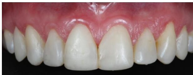
Figure 12. Final Direct restoration after polishing.

In interproximal the number 12 scalpel blade was used next to the neck of the teeth, along with the Sof-Lex® sanding strips of 3M / ESPE®, St. Paul, Minnesota, USA). The final polishing was done with paste for polishing (Diamond Ex-cel-FGM®, Joinville, SC, Brazil) using the felt disc (Figure 12).