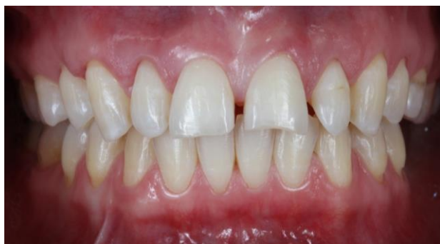
Figure 10. After 40 days of surgery.

The patient received guidance on post-operative care, recommended mouthwash with chlorhexidine digluconate 0.12% twice a day for seven days, in addition to analgesia was prescribed Acetaminophen 750mg every 6 hours, for three days and nimesulide 100mg, every 12 hours for three days.