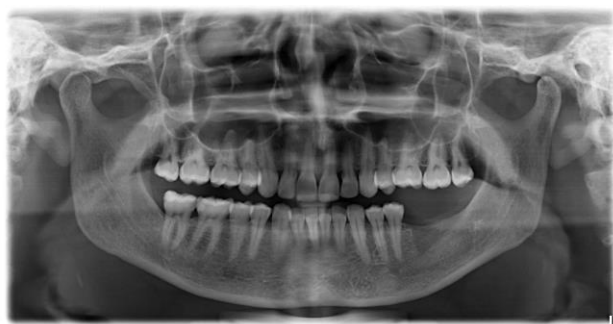
Figure 13. Final panoramic radiograph.

The patient was advised of the need for oral hygiene and flossing. The rhetorician us proservation the case were made men-sally and a new radiography control was performed after 6 months to certify that there was no aggression to supporting tissues and the same stable (Figure 13 and 14).