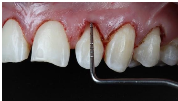
Figure 7. Collar Worker removed and verification of biological space, even with 2mm.

With the graduated periodontal probe Goldman Fox Williams found that the distance between the gingival margin and bone crest of 2 mm, indicating the need for osteotomy (Figure 7).