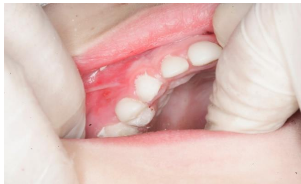
Figure 9. View of the upper right region after completion of endodontics, restorations and sealant application.

In element 54, endodontics with CTZ (chloramphenicol, tetracycline, zinc oxide and eugenol) was performed, and the insertion of CIV (Glass Ionomer Cement) and restoration in composite resin and composite resin restoration element occlusal and sealant application (Figure 9).