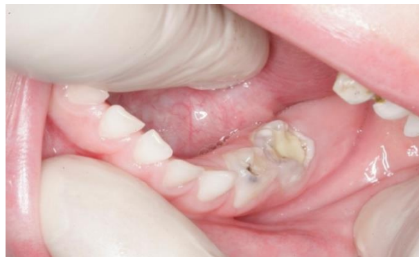
Figure 2. Intraoral view with carious lesion on elements 74 and 75 in the occlusal.