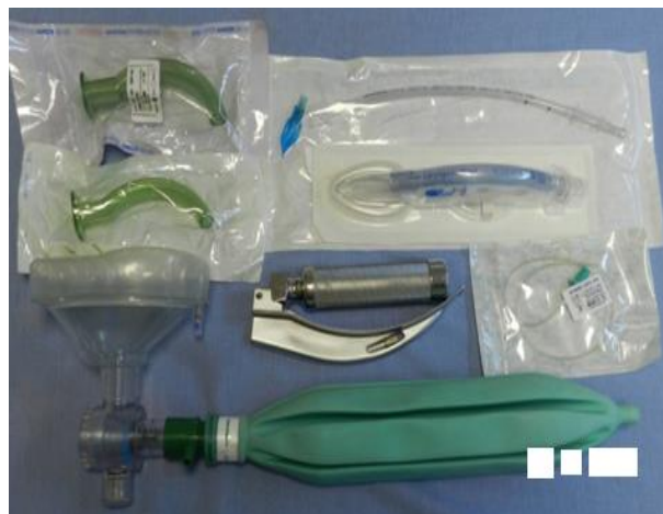
Figure 5. Ventilatory support.