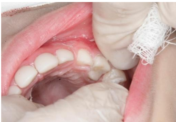
Figure 10. View of the upper left region after completion of endodontics, restorations and sealant application.

element 75, endodontics with CTZ medication, a guiding CIV base and restoration with composite resin (Figure 11).