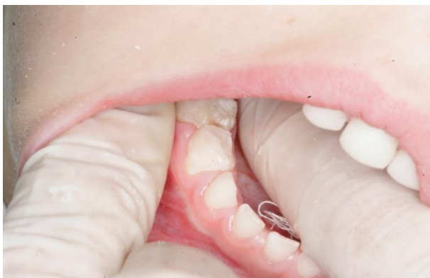
Figure 12. Side view of the lower right region.

Faced with a dentistry dental treatment made difficult by the patient's non-cooperation and after the attempt of all the management techniques, we can have pharmacological techniques for the control of anxiety and the cooperation of the child, to obtain a good clinical result in the short term. Therefore, it is up to the dental surgeon to analyze which behavior to take through a non-collaborative child, presenting and deciding with the parents what the sedative behavior to be chosen.