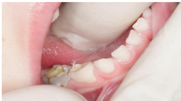
Figure 3. Intraoral view with carious lesion in elements 84 and 85 of this occlusal.

The proposed treatment plan was preventive treatment (oral hygiene instruction, prophylaxis and topical application of fluoride) and restorative treatment (adjustment of the buccal medium for later restorative treatment). Therefore, the health education for the child and the mother was initiated through oral hygiene instruction and diet recommendations with the accomplishment of management technique with child in the dental chair.