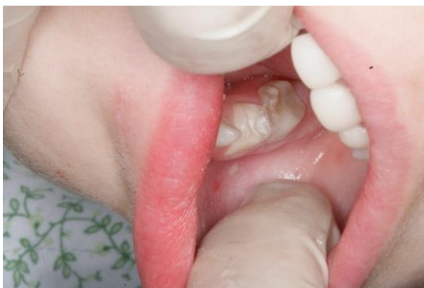
Figure 11. View of the lower left after completion of restorations.

In the 85-pulp cap element with Dycal® IVC lining and restoration in composite resin in the occlusal and vestibular (Figure 12).