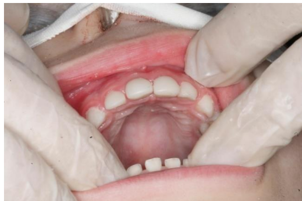
Figure 8. Frontal view after the end of treatment in the maxilla region.

In element 61 there was the vestibule restoration and class IV in composite resin color A1. The element 62 received a mesial restoration in composite resin (Figure 8). As a precaution, an upper impression was made for the preparation of an apparatus if the element 51 could fracture.