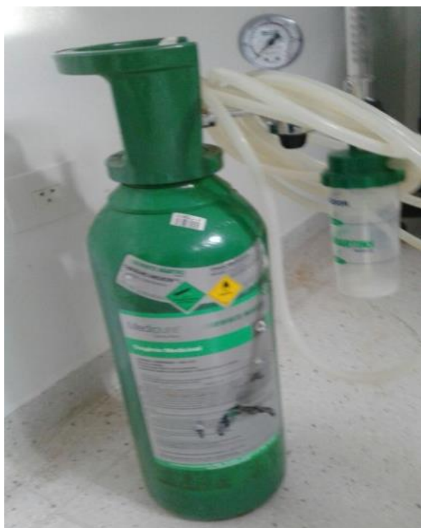
Figure 7. Oxygen torpedo and defibrillator for patient monitoring, induction and recovery.

After sedation, clinical care was started by performing local infiltrative anesthesia with the use of 4 tubes of the