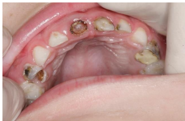
Figure 1. Intraoral frontal view with multiple carious lesions in elements 52, 54, 55, 61, 62, 64, 65 and total destruction of the crown of 51.

In the evaluation of caries risk, a diagnosis of carious lesion was made on the following elements: 51, 52, 54, 55, 61, 62, 64, 65, 74, 75, 84 and 85. Elements 53, 63, 73, 72, 71, 81, 82 and 83 are healthy (Figure 1, 2 and 3).